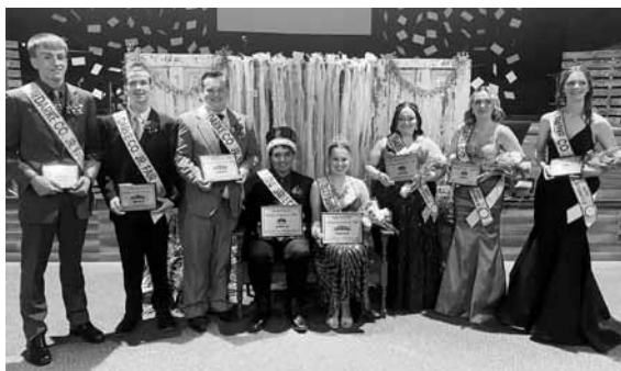
Seated: Queen , King Standing (L-R): ,